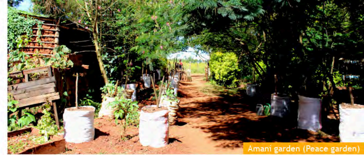
Amani garden (Peace garden)