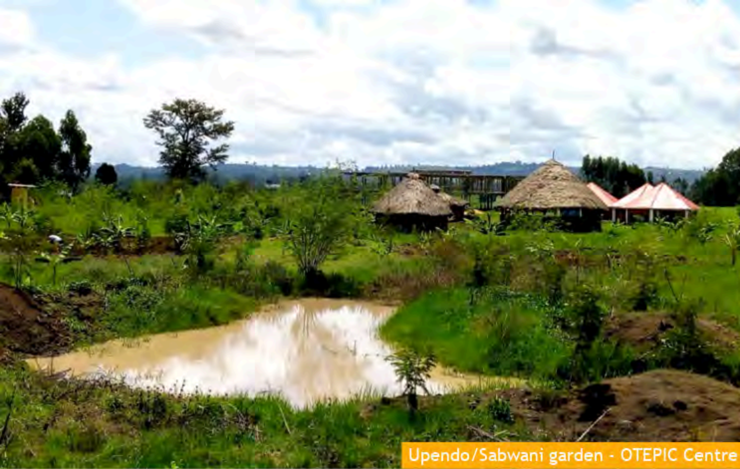
Upendo/Sabwani garden - OTEPIC Centre